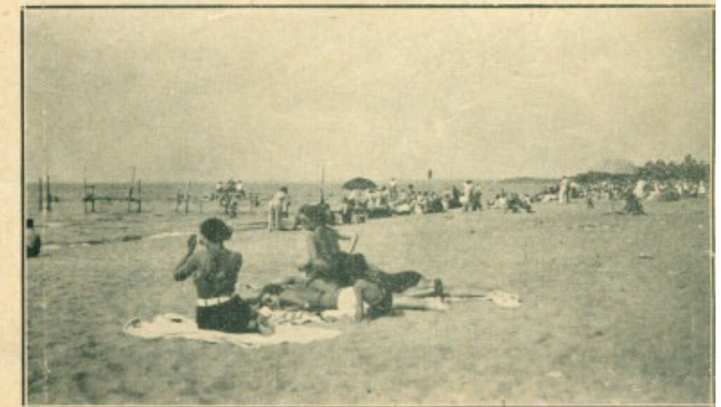
Part of the bathing beach at this popular resort.