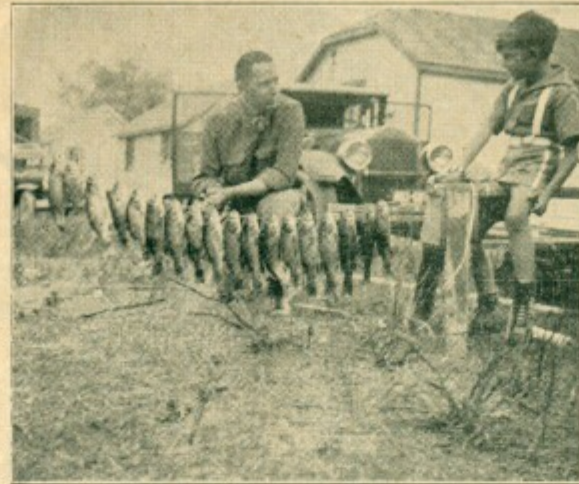
A day's catch of bass for three people—caught in Long Point Bay.

Long Point Beach Resort and Development Ltd. Building Contractors