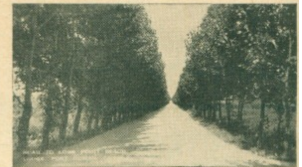
Part of the lovely paved drive-way leading from the main highway to Long Point Beach.